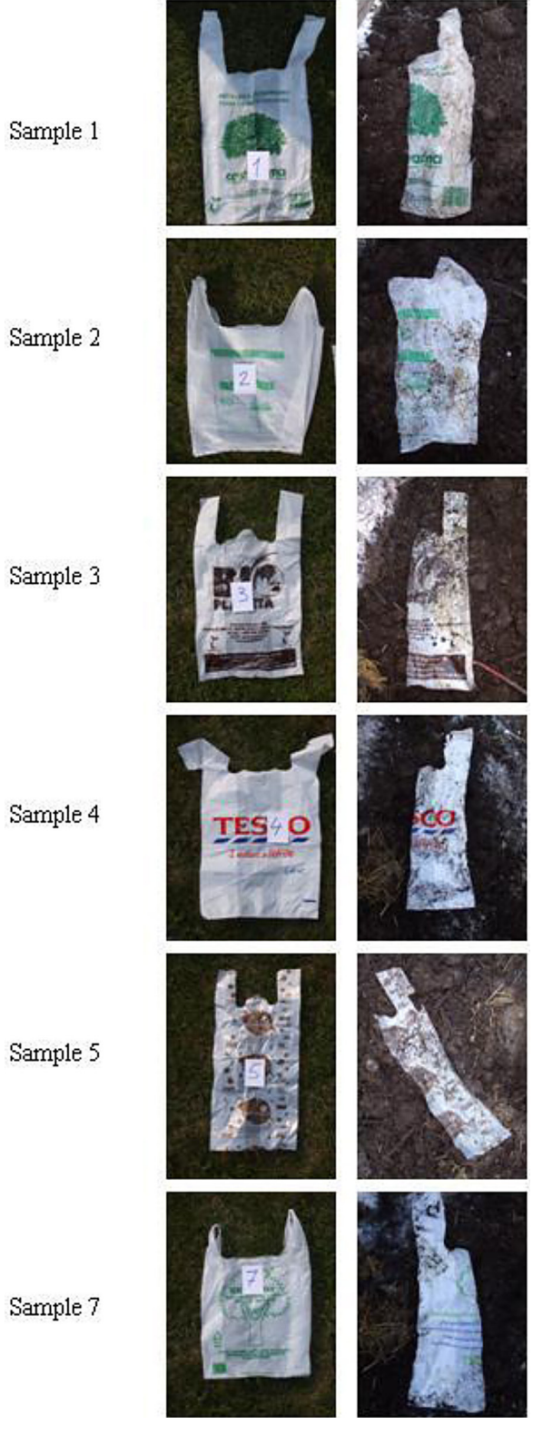
Figure 7. Samples 1-5, 7 before and after the experiment – the compost pile

The samples of plastic bags and single-use plastic bags (samples 2–7) stored in the soil of the grassy area of the orchard experienced no visual changes. Photographs of the samples before and after the experiment are shown in Figure 9.