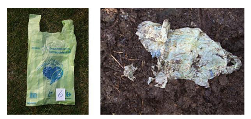
Figure 6. Sample 6 before and after the experiment – the compost pile

The samples that were examined in compost bin 2, the disposable tableware made of degradable plastic material (samples 8 and 9) entirely degraded; no visible fragments were left, see Figure 8.