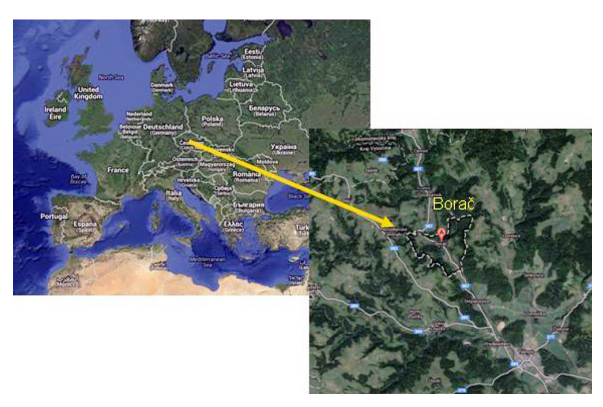
Figure 1. Location of the research

The site where the research was conducted is located in the Czech Republic, in a village called Borač that is situated in a valley on the border of the Vysočina Region and the South Moravian Region, with an altitude of 279 m. Location of the site is shown in Figure 1.