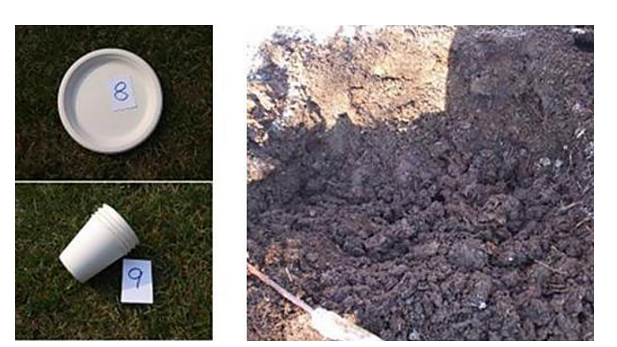
Figure 8. Sample 8 and 9 before and after the experiment – the compost pile

The samples of plastic bags and single-use plastic bags (samples 2–7) stored in the soil of the grassy area of the orchard experienced no visual changes. Photographs of the samples before and after the experiment are shown in Figure 9.