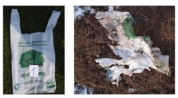
Figure 10. Sample 1 before and after the experiment – the orchard

degradable in the marine environment. Furthermore, a number of petrochemical-based polymers are certified biodegradable and compostable. Biodegradability is directly linked to the chemical structure, not to the origin of the raw materials.