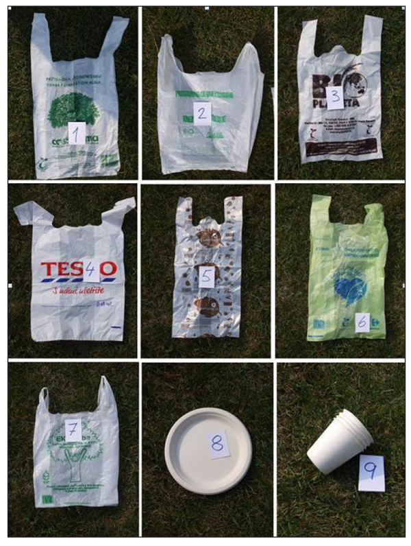
Figure 3. Photographs of the observed samples

the other bin (compost bin 2) had dimensions of 105 \times 100 \times 80 cm (see Figure 2).