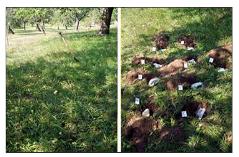
Figure 5. Initiation of the experiment in the orchard