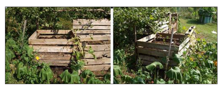
Figure 2. Home compost bins