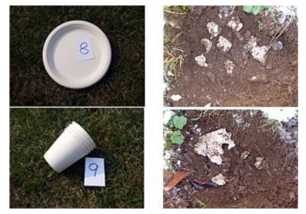
Figure 11. Sample 8 and 9 before and after the experiment – the orchard

Products that can compost in a variety of backyard/home system greatly increase the opportunities for waste diversion, given that many regions of Czech Republic lack commercial composting facilities.